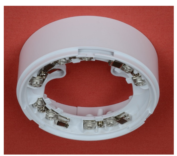
481-004 high profile 102 mm 9-terminal base