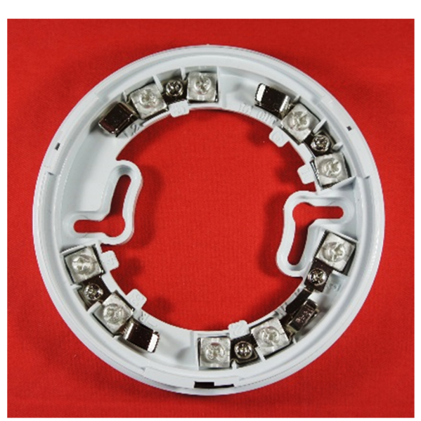
CN3041 / CN3043 low profile 102 mm 9-terminal base